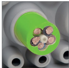
Conical shape on back provides additional sealing and strain relief