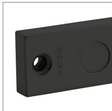
Also available in black.