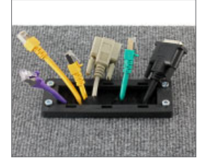
... as well as for energy and building technology